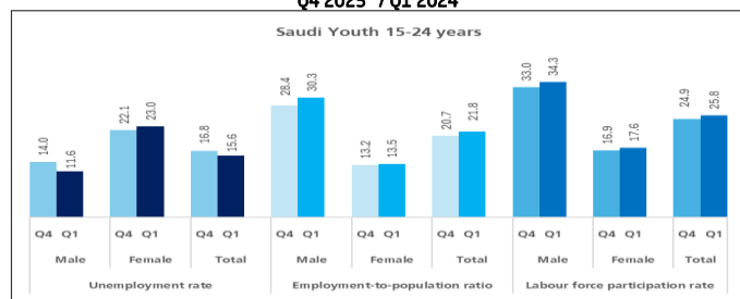
Figure 1. Main Labor Market Indicators for Saudis by Age Group Q4 2023 / Q1 2024