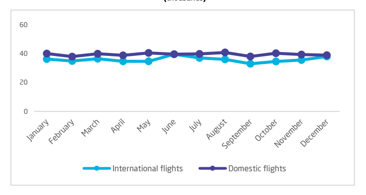
Figure 2. Number of domestic and international flights by month at Kingdom's airports in 2024 (thousands)

2024 results indicated that the number of domestic flights at Kingdom's airports reached 474 thousand, reflecting a 12% increase compared to 2023, where international flights totaled 431 thousand, representing a 10% growth over the previous year. King Abdulaziz International Airport topped the list in terms of the number of flights, with nearly 290 thousand flights, followed by King Khalid International Airport with 274 thousand, and King Fahd International Airport with 105 thousand. As for the average daily flight traffic at Kingdom's airports, domestic flights averaged 1,295 per day, while international flights averaged 1,178 per day. As for the Kingdom's air connectivity index for the year 2024, there was an increase of 16% over the year 2023. (Figure 2)