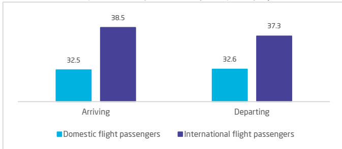
Figure 1. Number of arriving and departing passengers on domestic and international flights at airports in the Kingdom for 2025 (million passengers)

Air Transport Statistics 2025 showed an increase in the total number of passengers traveling through the Kingdom's airports, reaching 140.9 million passengers, up by 9.6% compared with 2024. The number of arriving and departing passengers on international flights at the Kingdom's airports reached 75.8 million passengers, reflecting an increase of 9.4% compared with 2024, while the number of arriving and departing passengers on domestic flights reached 65.1 million passengers, recording a 9.8% increase compared with 2024. (Figure1) King Abdulaziz International Airport ranked first among the Kingdom's airports in terms of arriving and departing passenger traffic, recording 53.5 million passengers, an increase of 9.0% compared with 2024. Followed by King Khalid International Airport with 40.8 million passengers, up by 8.7%, and King Fahd International Airport with 13.7 million passengers, an increase of 7.0%. The average daily number of arriving and departing passengers on domestic flights at the Kingdom's airports reached 178.6 thousand passengers, while the average daily number of arriving and departing passengers on international flights reached 207.7 thousand passengers.