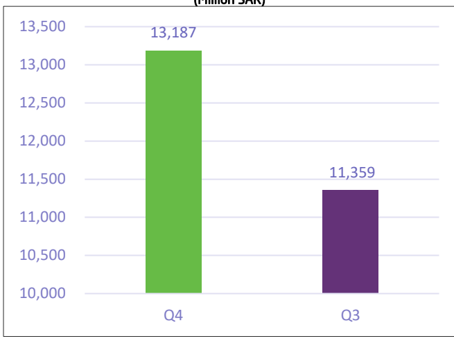
Figure1: Quarterly FDI net inflows for the fourth quarter of 2023 (Million SAR)

The net flow of foreign direct investment (FDI) in the Kingdom amounted to more than 13 billion SAR during the fourth quarter of 2023, registering an increase of 16.0% compared to the third quarter of the same year, which was about 11 billion SAR. (Figure 1).