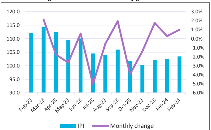
Figure1. General index and monthly growth rates

Sub-index for electricity, gas, steam and air conditioning supply and sub-index for water supply, sewerage, waste management and remediation activities recorded an annual increase of 7.7% and 8.5%, respectively, but due to the low weight of these activities, they did not have a significant impact on the index. Based on month-on-month trend, the sub-index for electricity, gas, steam, and air conditioning supply increased by 7.6%, subindex for water supply, sewerage, waste management and remediation activities increased by 2.1%.