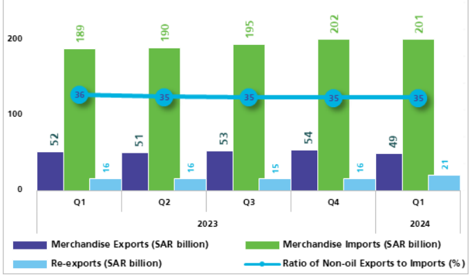
Figure 3. Trade balance & trade volume, value SAR billion