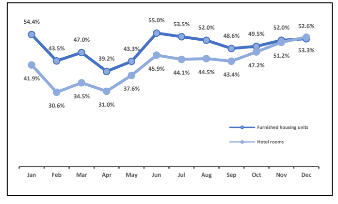
Table 1. Key Indicators of Tourism Sector (2021)